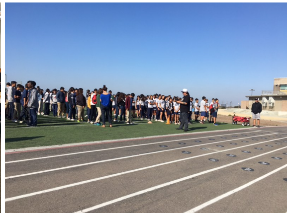
Shake Out at VDM