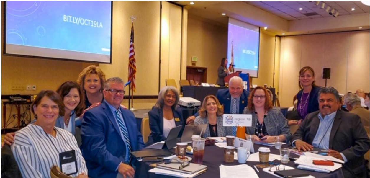
Photo of the ACSA region 18 Leadership Team (San Diego and Imperial Counties)