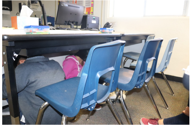
Shake Out at SYMS