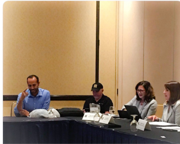
Photo of the ACSA State Council Presidents and Committee Chairs Meeting.